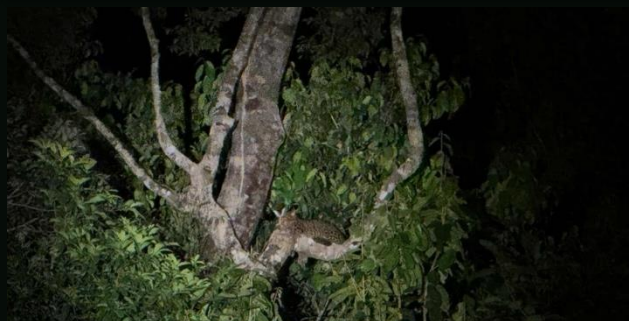
Marbled Cat Night sighting

25 C 29.83 inHg TRAILCTC02 03/01/2025 09