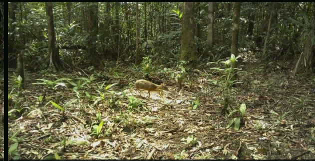
Mouse Deer TRAILCAM19

31 C 29.71 inHg TRAILCAM19 10/26/2025 12