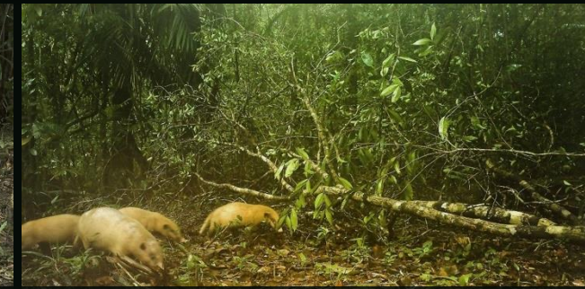
Yellow-throated Marten · TRAILCTC02

31 C 29.71 inHg TRAILCAM19 10/26/2025 12