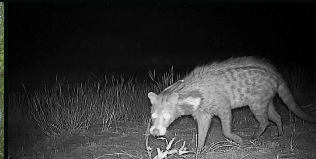
Large Indian Civet · Night