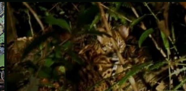
Marbled Cat Camera trap