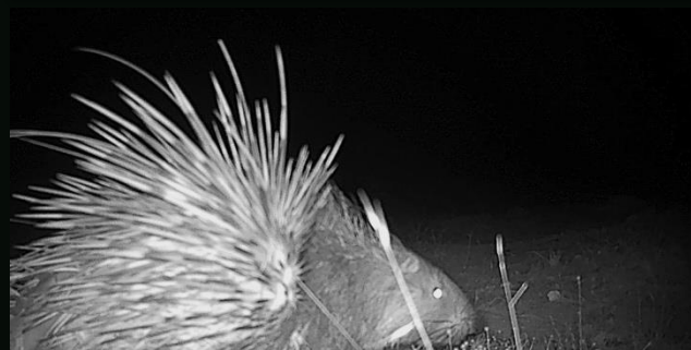
Porcupine TRAILCTC02 · Night

25 C 29.83 inHg TRAILCTC02 03/01/2025 09