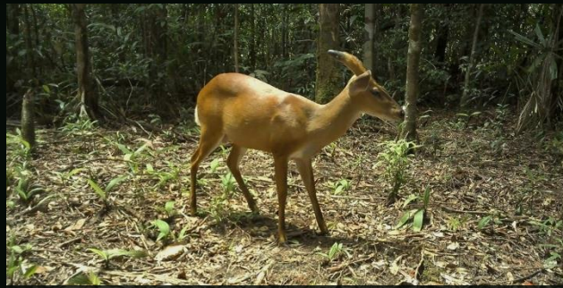
Barking Deer TRAILCAM19

27 C 29.65 inHg TRAILCAM13 08/20/2025 07