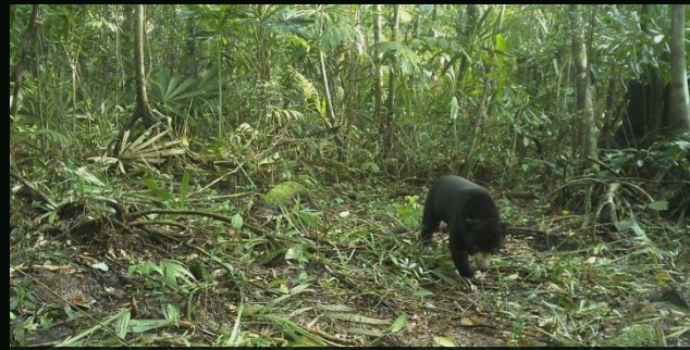
Sun Bear TRAILCAM13

27 C 29.65 inHg TRAILCAM13 08/20/2025 07